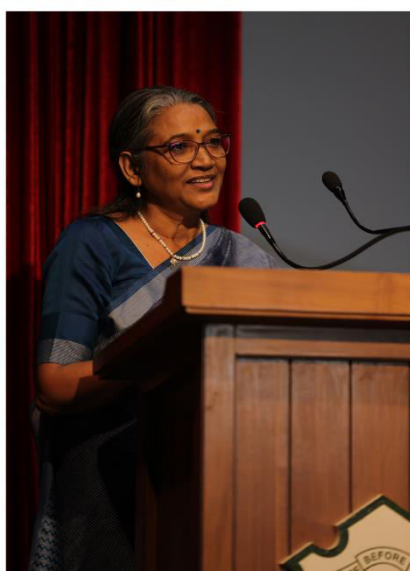
Page 6 of 15